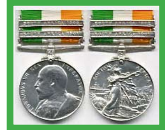
Kings Medal - South Africa

His period of service in South Africa earned him the award of the "Kings Medal" which was only awarded to servicemen who served in excess of eighteen months. He was the only man from the Eltham, Heidelberg or Whittlesea Shires to earn the award.