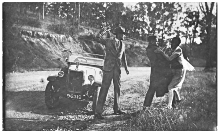
Scene from 'Borrowed Plumes' - from Australian National Library Collection