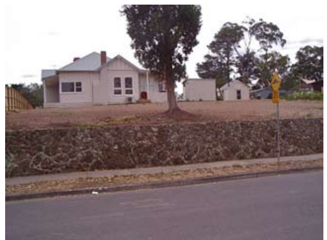
'Belle Vue' 2015