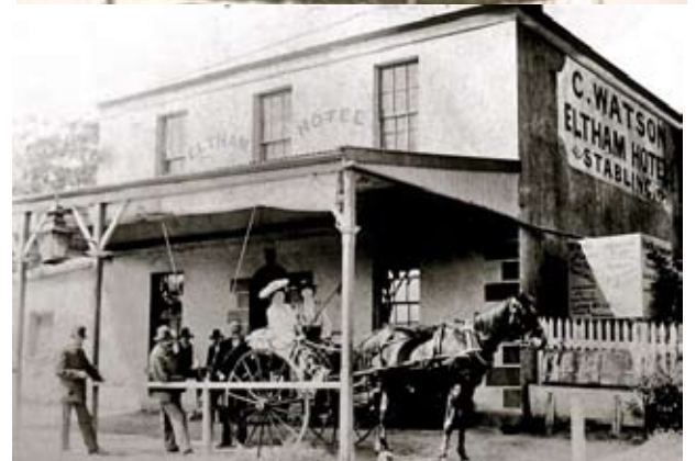
Watson's Eltham Hotel