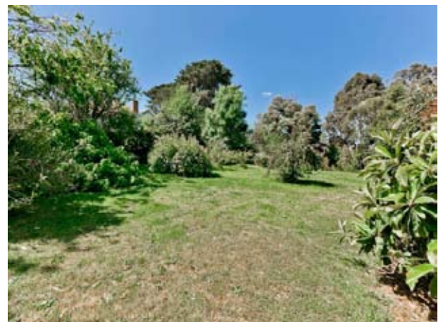
'Belle Vue' 2007

This free walk is open to the general public as well as Society members. Dogs are not permitted on Society excursions. The phone number for contact on the day is 0409 021 063.